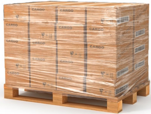
Stretch Wrap DR 376_01